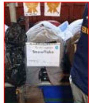
Snowflake - The Overall Winner -

I've been to 5 festivals so far. Twice in Manchester, Birmingham and Burton in 2023 and this year. The second Manchester event in 2014 was special in that it was held inside the indoor cycle track of the National Velodrome. Team GB Olympic cyclists were training and whizzing past while drinkers enjoyed their beers.