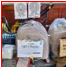
Elland 1872 Porter - Hopefully not the last time

Due to queuing and over crowding on the first day last year a timed ticketing system was introduced this year; afternoon and evening. The friends I met opted for the first of two sessions of the first day. More beer choice ! The Champion Beer winners were announced from the stage during our session. The only North East beers I could find were from Cullercoats Brewery