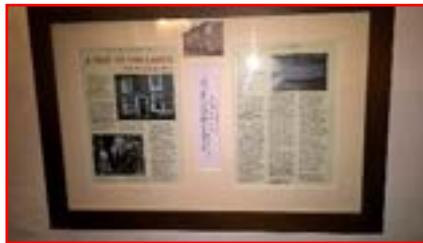
Old Crown

2004 and Sir Chris Bonnington another supporter.