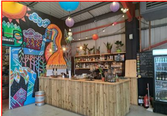
TYNESIDE & NORTHUMBERLAND CAMRA

Our next stop - above - was only a few minutes walk away to Albion Row for the Two By Two brewery tap with a pop up pizza van - Trigo on the day of our visit, MnM's Porter had just gone off but Signature Porter was on its way to redeem the situation. Hubby was spoilt for choice for hazy beers. This place has a cracking bar and a sun trapped courtyard – it was scorching