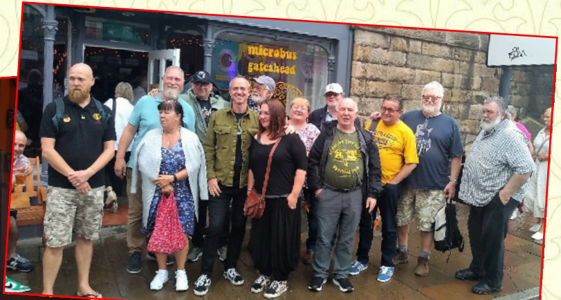
TAKEN BY MICROBUS OWNER