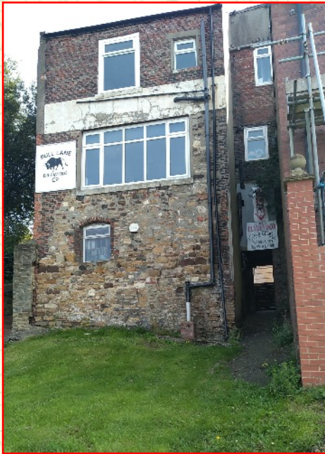
The back of The Clarendon, showing the still present Brewery sign to the left of the large window. The steps up to High Street East can be seen on the right below the pub sign.