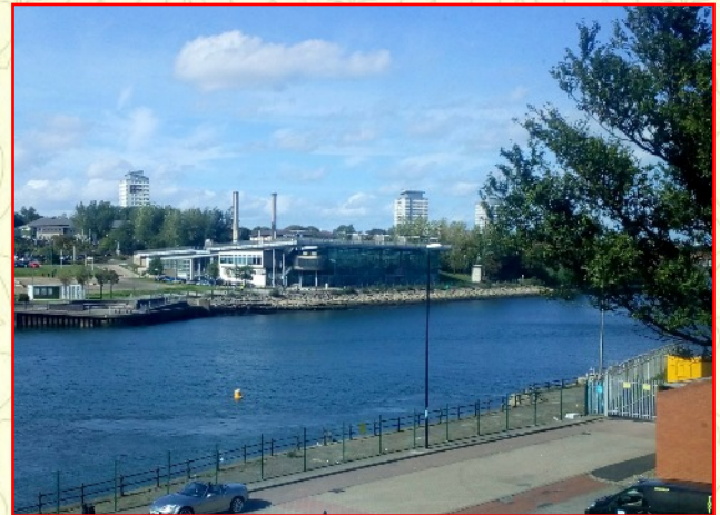
The view from the window inside the pub, showing the National Glass Centre (the building with the two chimneys) on the other side of the River Wear.

The beer was available in the pub and also in the local area. The brewery closed however in 2011, with the kit being transferred to Firebrick Brewery in Blaydon. The signage for the brewery is still in place, both at the side and the back of the pub overlooking the river.